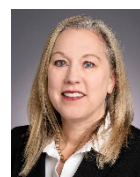
Sen. Judy Seeberger

2409 Minnesota Senate Building St. Paul, MN 55155 (651) 296-4875