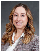
Rep. Kaela Berg

237 State Office Building St. Paul, MN 55155 (651) 296-7808