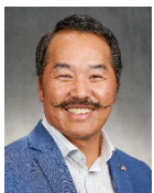
Rep. Ethan Cha

577 State Office Building St. Paul, MN 55155 (651) 296-5387