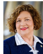
Sen. Carla J. Nelson

2231 Minnesota Senate Building St. Paul, MN 55155 (651) 296-7136