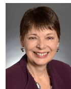
Sen. Sandra L. Pappas

2301 Minnesota Senate Building St. Paul, MN 55155 (651) 296-4848