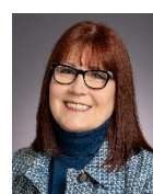
Sen. Bonnie S. Westlin

2109 Minnesota Senate Building St. Paul, MN 55155 (651) 297-8060