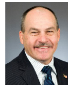
Sen. Jeff R. Howe

3109 Minnesota Senate Building St. Paul, MN 55155 (651) 296-6153