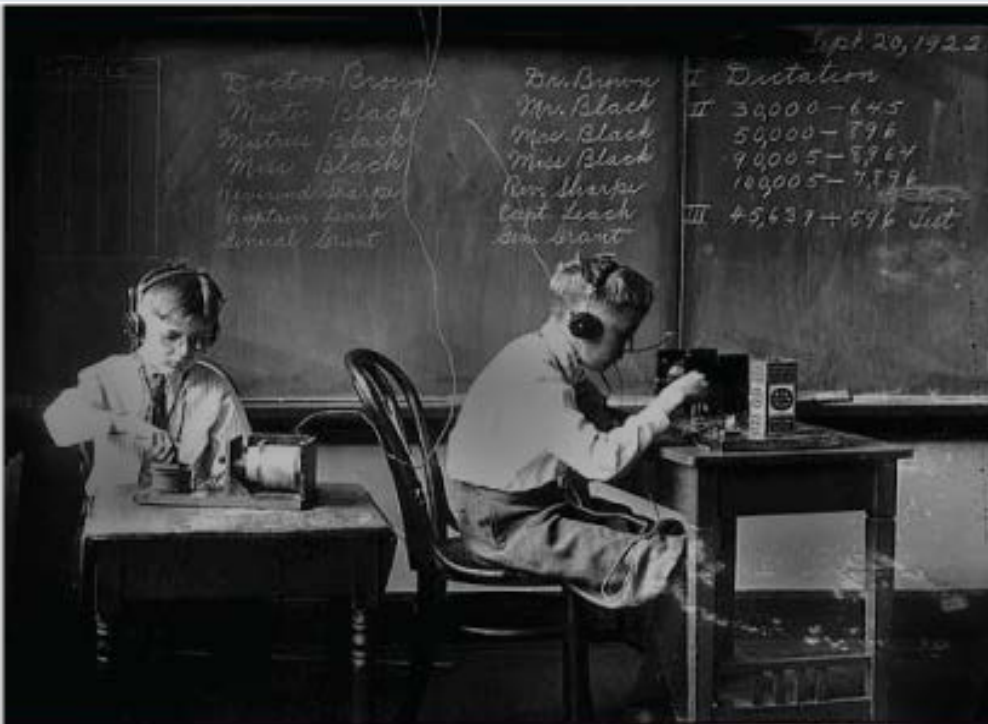
The Radio Operators – Horace Mann 1922

Serving the retirement needs of St. Paul Teachers since 1909