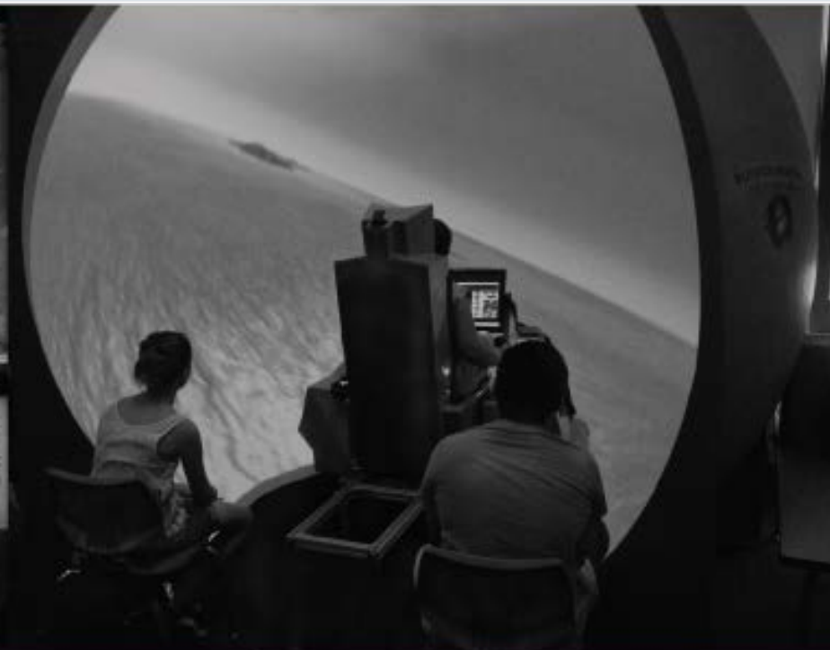
Aeronautics Training – Johnson Sr. High 2014